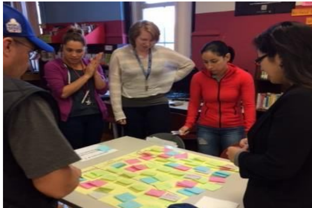
The school community at Spry Elementary in Chicago, IL, break up into small groups to identify common themes

From here, provide each group the opportunity to share out their emerging themes and re-occurring words or phrases.