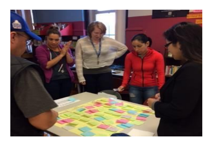
The school community at Spry Elementary in Chicago, IL, break up into small groups to identify common themes

From here, provide each group the opportunity to share out their emerging themes and re-occurring words or phrases.