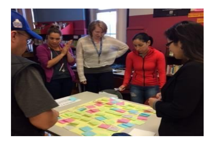
The school community at Spry Elementary in Chicago, IL, break up into small groups to identify common themes

From here, provide each group the opportunity to share out their emerging themes and re-occurring words or phrases.